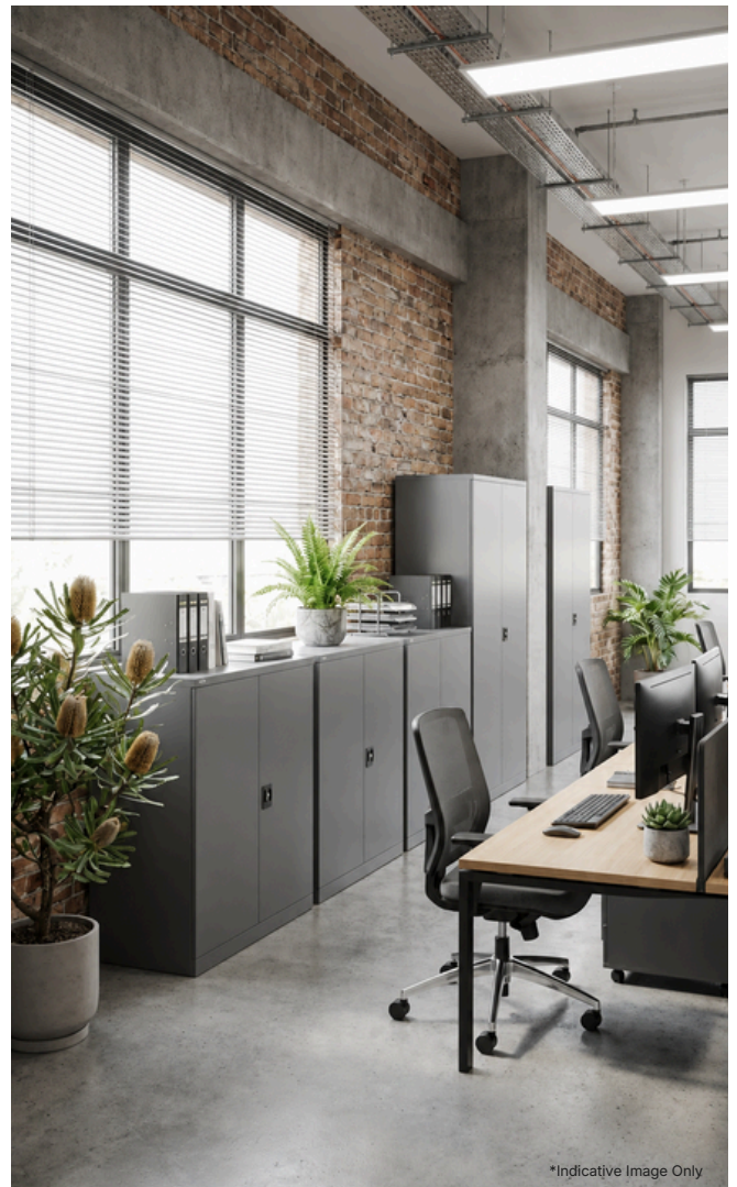
*Indicative Image Only

Constructed for long-term durability and daily commercial use, this cupboard meets British Standards for quality and reliability. Its clean, professional design makes it suitable for offices, schools, healthcare facilities, and general workplace storage applications.