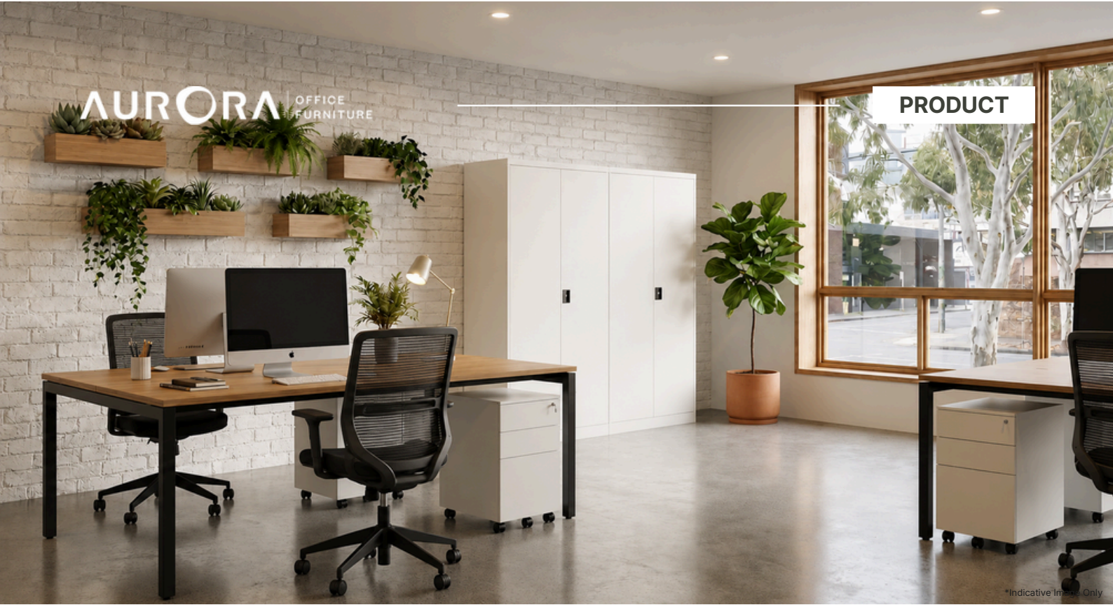
*Indicative Image Only