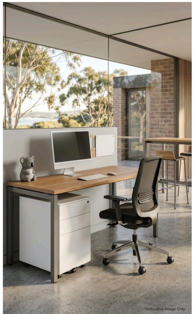
*Indicative Image Only

Available in both Standard and Slimline models, the FM Metal Mobile Drawer Collection offers flexible storage solutions to suit a wide range of workspace layouts.