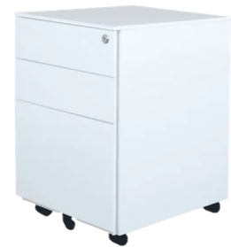
FM Metal Mobile Drawer Standard