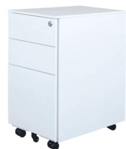
FM Metal Mobile Drawer Slimline